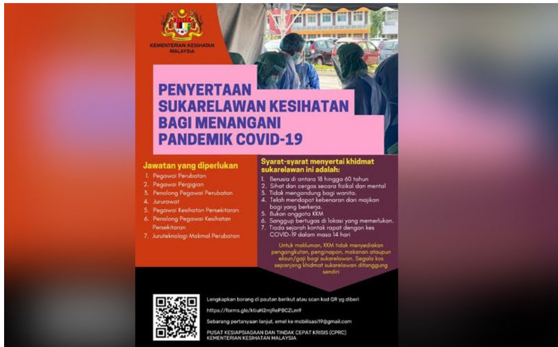
The health ministry's poster uploaded onto its social media platforms on May 27.

PETALING JAYA: The health ministry has come under criticism for not offering any perks for volunteers wanting to help fight the Covid-19 pandemic, although allocations for volunteers have been announced by another ministry.